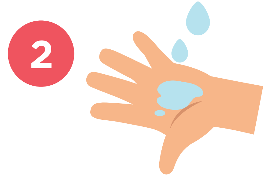
2 Apply Soap (Enjabonar)