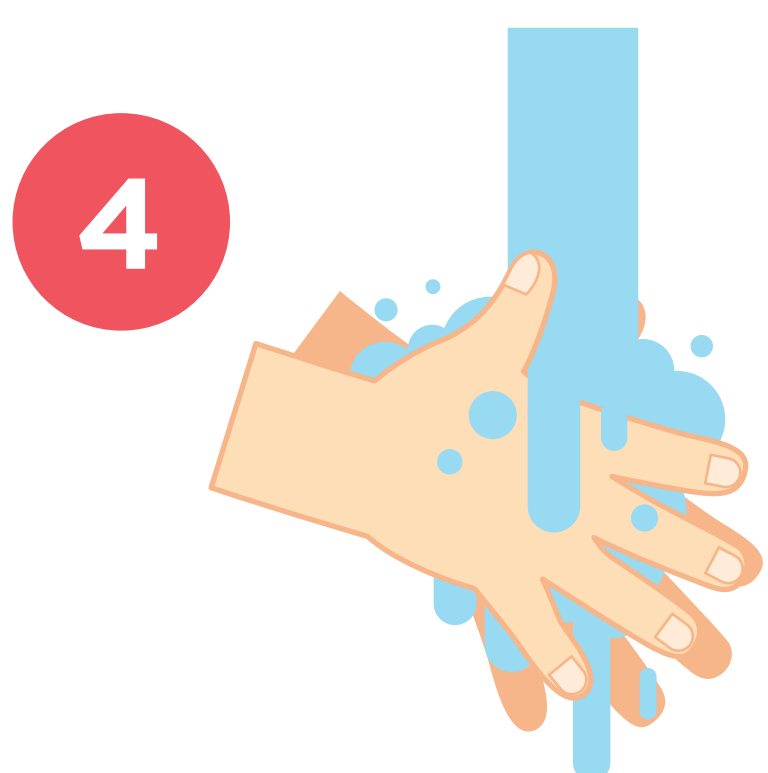
4 Rinse Hands Thoroughly (Enjuagar)