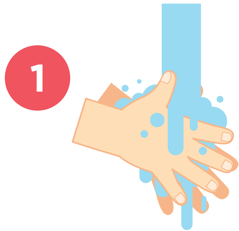
1 Wet/Pre-rinse (Mojar)