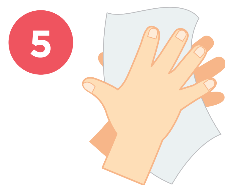
5 Dry with Paper Towel (Secar)